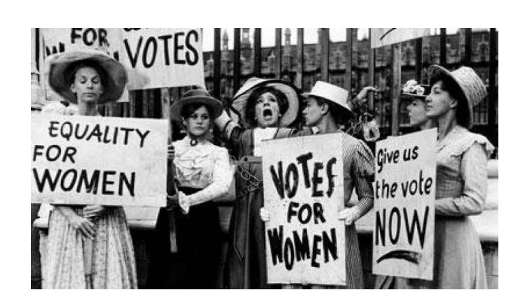
1920: 19th Amendment Women's right to vote